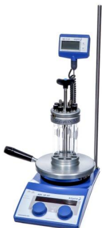
Caption: DrySyn OCTO reaction station