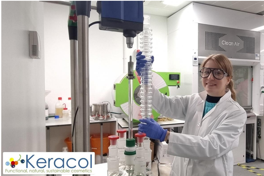
Caption: Large scale extraction of mandarin orange peel at Keracol Ltd